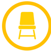
Green Star Interiors