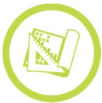
Green Star Communities