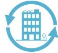
Green Star – Performance