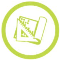
Green Star Communities