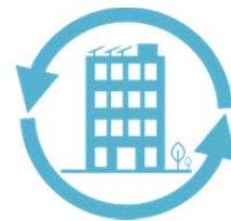
Green Star Performance