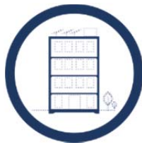
Green Star Design & As Built