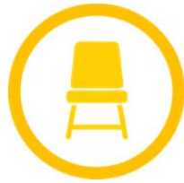
Green Star Interiors