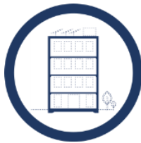
Green Star Design & As Built