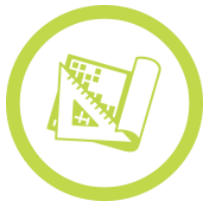
Green Star Communities