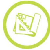
Green Star – Communities

In the Green Star – Communities and Green Star – Performance rating tools, there are ‘Initial’ and ‘Recertification’ submissions in place of ‘Design Review’ and ‘As Built’ submissions. Project teams shall use the below guidance for these rating tools when compiling the relevant supporting documentation.