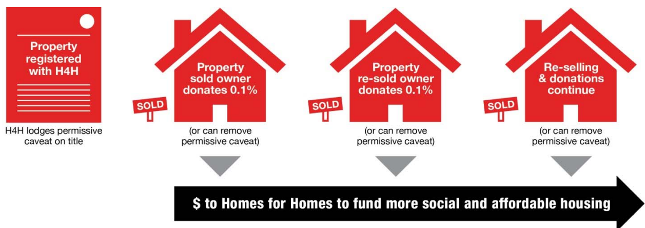
Illustration depicting how the H4H program works.