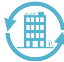
Green Star Performance