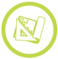
Green Star Communities